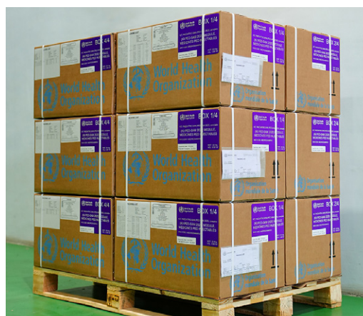
One PED/SAM kit can treat up to 50 children suffering from severe acute malnutrition and associated medical issues.