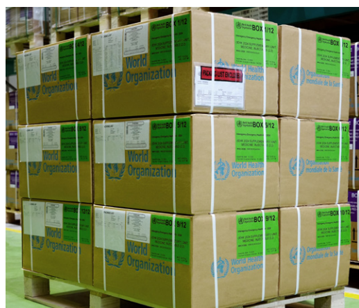
IEHK 2024 contains life-saving medicines and medical devices to treat 10,000 people for up to 3 months.